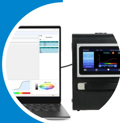
Color management software