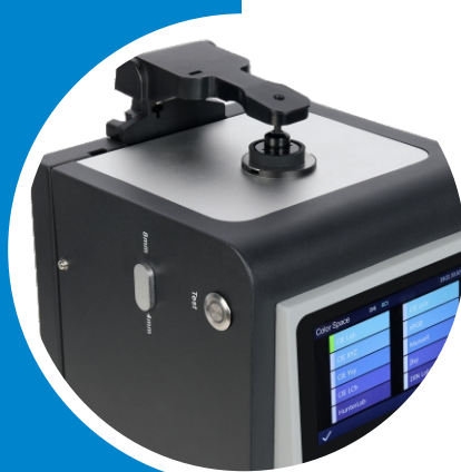
Horizontal or vertical measurement